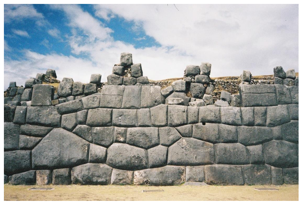
Architecture of Saqsaywaman (~two thirds destroyed by the Spanish)