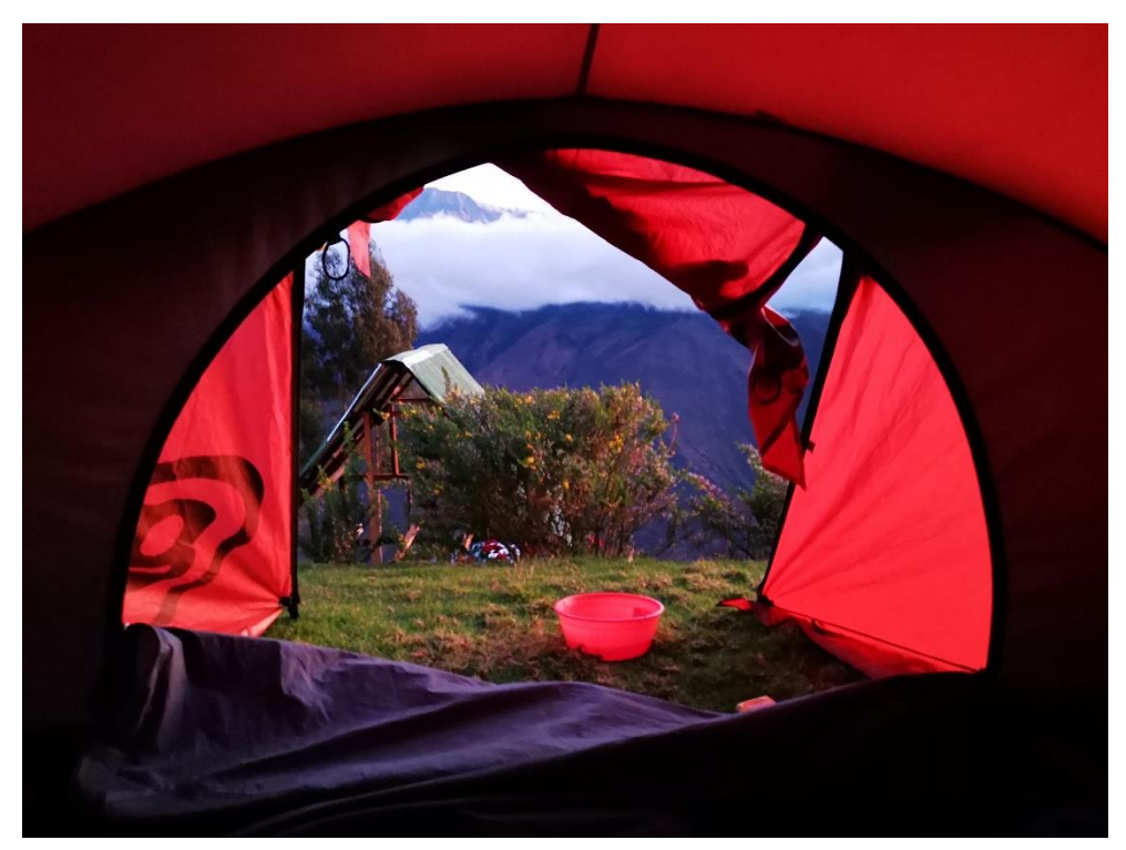
View from the Campsite at Marampata 2,850 m.a.s.l.

The day finally came to start out to the head of the Choquequirao trail. I was slightly apprehensive about the people who would be accompanying me on the trek. Before leaving Ireland, I had asked about how big the group would be. There would only be 5 of us and all the others would be women over twice my age. Not exactly what I was expecting when I booked the trek. Little did I know that this was actually a massive opportunity for me to connect with this group of people in a way that I would never otherwise get the chance to in my day-to-day life. Going back to my motivations for going to Peru, this is exactly what I wanted to get out of the trip. The trek itself was stunningly beautiful. The second day from Santa Rosa Baja, through Marampata, to the ruins of Choquequirao and back to Marampata was by far the most challenging. The food was unfortunately not substantial in terms of portion size but was also making me sick. I was truly running on fumes that second day, and no exaggeration, fell fast asleep on reaching Choquequirao and as the guide was explaining the significance of the site.