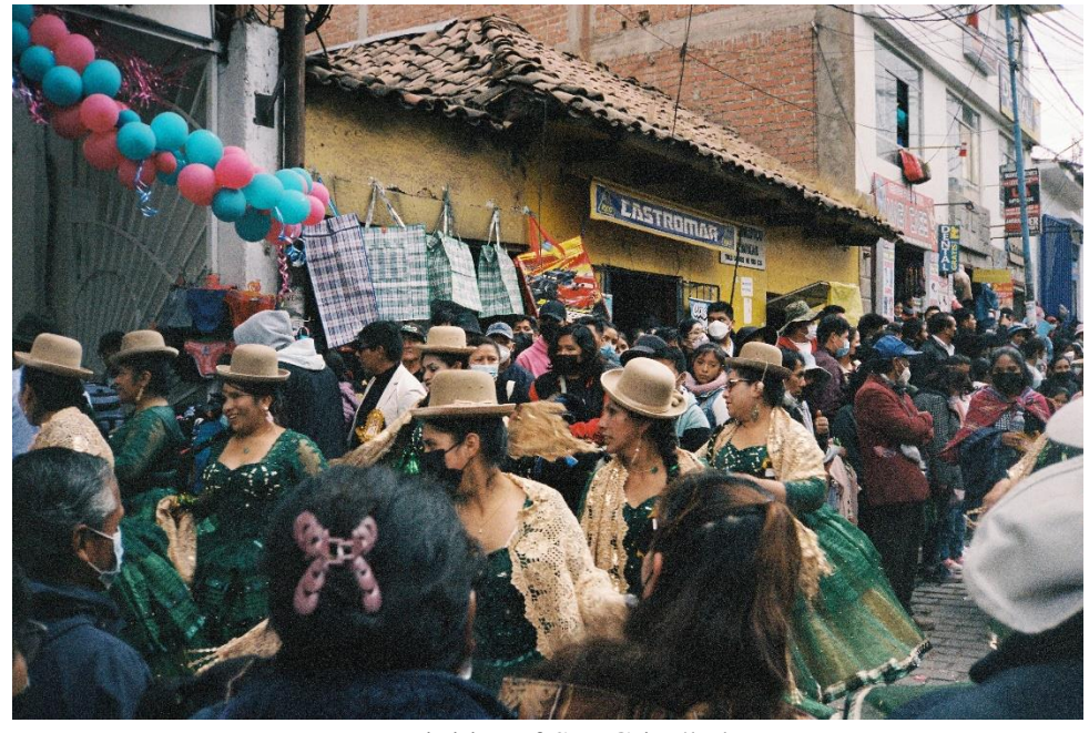
Festivities of San Cristóbal

When I arrived in Cusco, I felt I could relax. I wouldn't have to worry about transport again until my flight back to Lima which was 10 days away. The city is also much smaller which meant I could walk almost anywhere I wanted to go. It was around this time that I started to feel like I was actually on holiday. During my three days pre-trek, I did normal holiday things which included a few guided tours outside the city to see some ancient Inca sites. The festival of San Cristóbal happened to be underway so there was a nice level of excitement around the city. In addition, a re-enactment of the Situa, a health and ritual purification festival, was staged in the grounds of Qorickancha one of my nights there. I also got the chance to attend a local professional football match which I was invited to by the family of one of my tour guides.