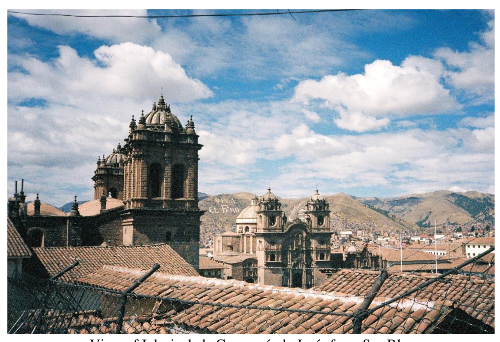
View of Iglesia de la Companía de Jesús from San Blas